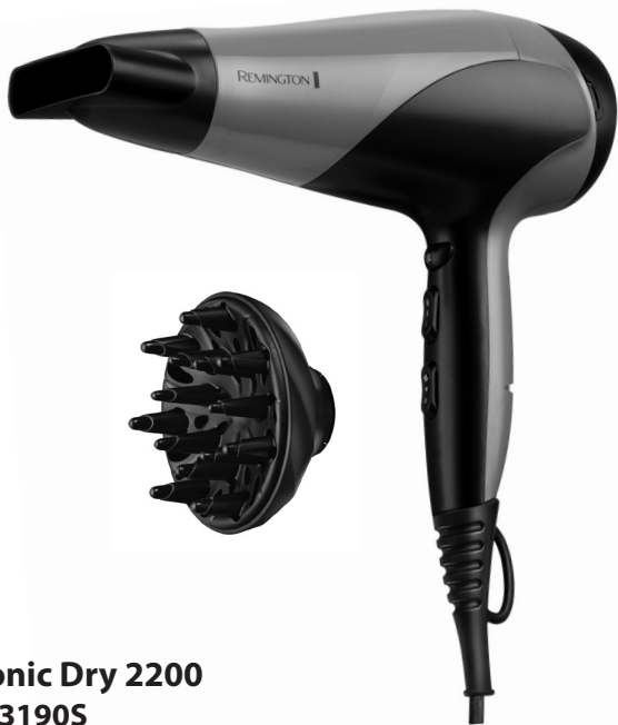
Ionic Dry 2200 D3190S