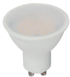
GU10 Milky Cover