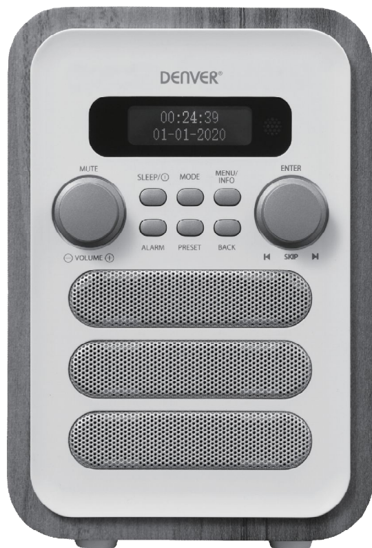
DAB - 48 RADIO DAB/FM USER MANUAL